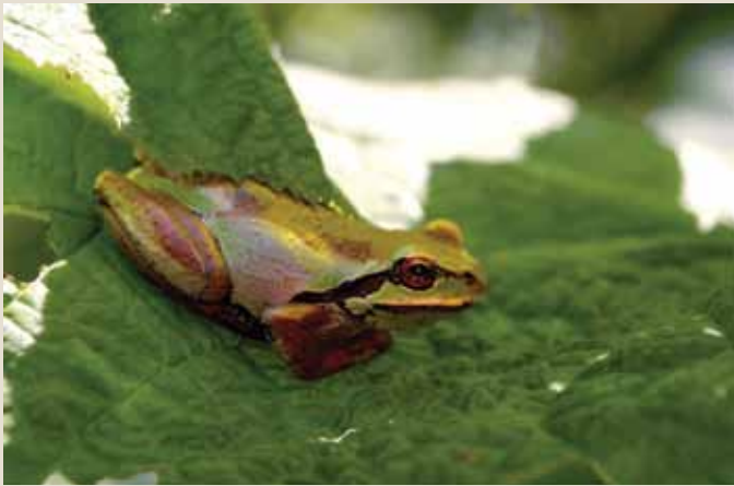
Pacific Chorus Frog.

upheld. Clearly, a sustainable stewardship program is a priority.